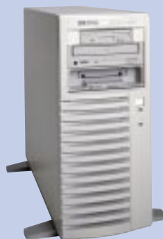
Integrated HP SureStore T20Xi tape backup solution

From the exceptionally cost-effective HP SureStore T20Xi bundle to the high-performance HP SureStore Digital Audio Tape (DAT) accessory, there's a solution for you.